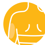
back of arm